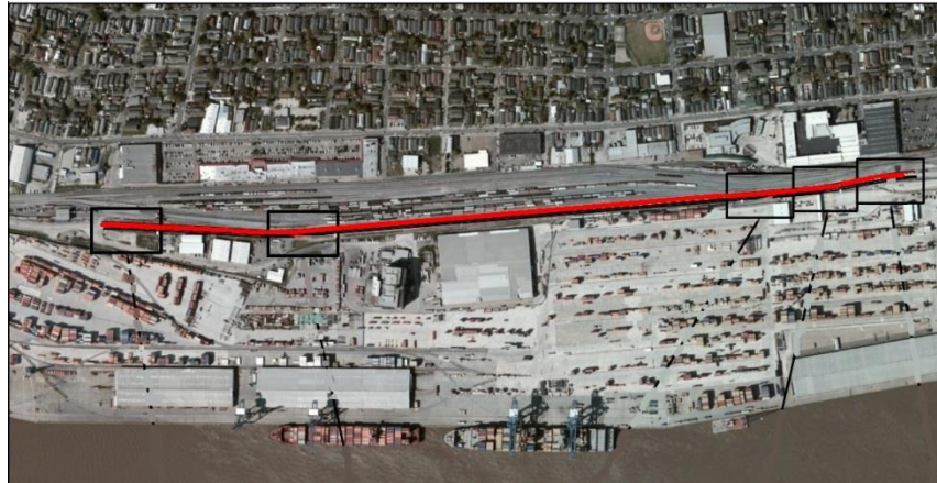
Nashville to Napoleon